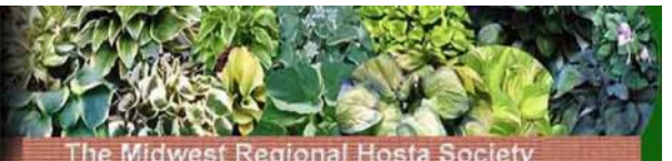
The Midwest Regional Hosta Society